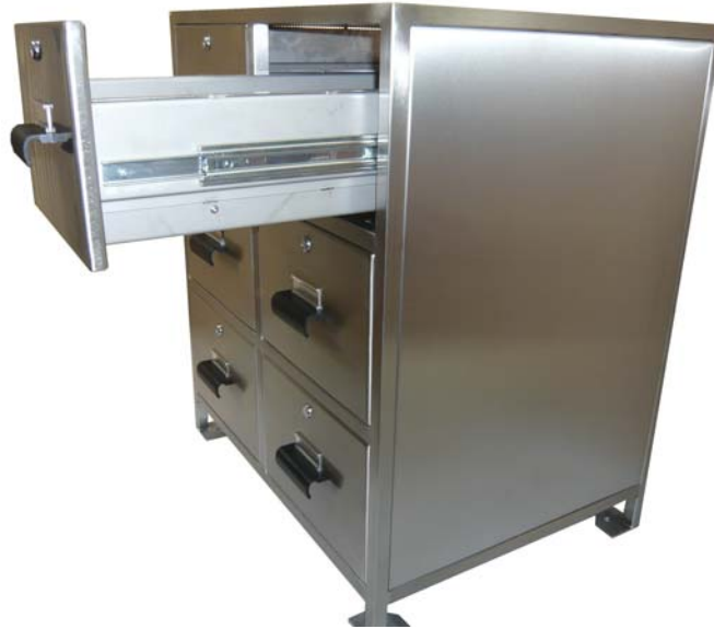
Cabinets powder coated