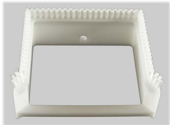
Installation position at hopper outlet